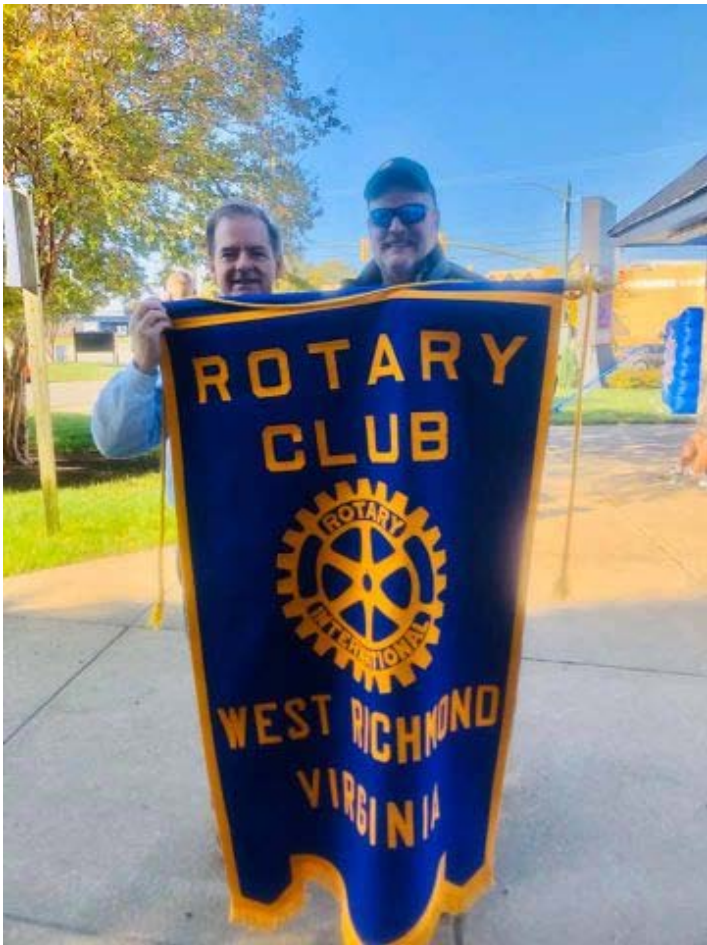
Representing Rotary at the Chili Cookoff. Go team West Richmond.