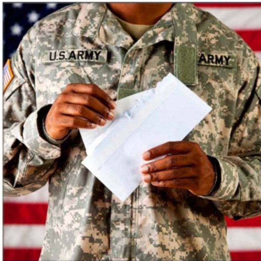
The Blackstone Club had a booth during Holiday Open House on November 29th for the public to sign and/or write messages of encouragement and gratitude in holiday cards that will be sent to service members who can't make it home to their families during the holidays.