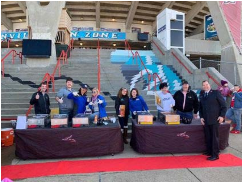
Great day supporting the Coats for Kids charity and raising money for community youth. Fun Run here we come.