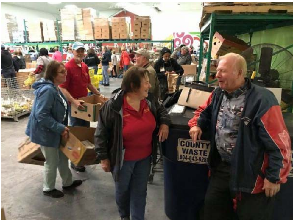
Members of the Huguenot Trail Club volunteered at the Chesterfield Food Bank.