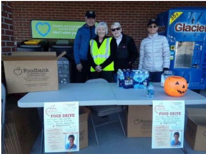
Norfolk Rotarian's out in the community doing good work with Foodbank of Southeastern Virginia